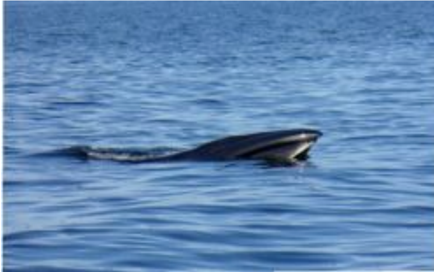
Sei whale photographed off Wester Ross on 16th September