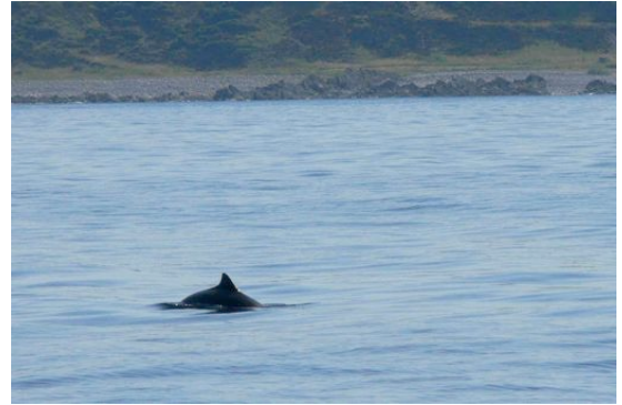
Harbour porpoise, Kevin Hepworth

After poor weather in August, the weather improved dramatically in September as did sightings, with the reappearance of bottlenose dolphins at Aberdeen Harbour at the end of the month.