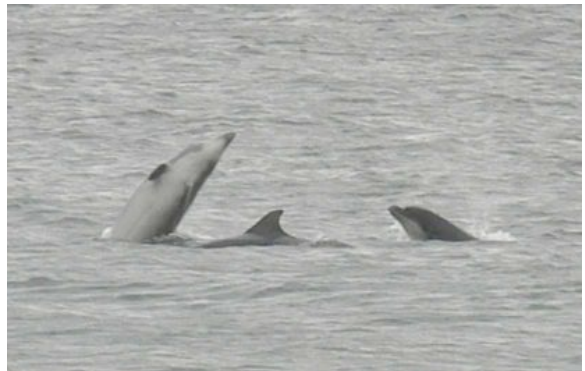
Bottlenose dolphins

We received 68 sightings reports in August. For the second month running, a total of six species were reported in our region, with the highlight once again being Risso's dolphins, with five encounters of between one and six animals. The pod of six, which were seen off Balmedie during a NORCET ferry survey, surfaced alongside the ferry and was visible underwater in near perfect conditions. The other highlight was a report of three orcas heading north past Johnshaven