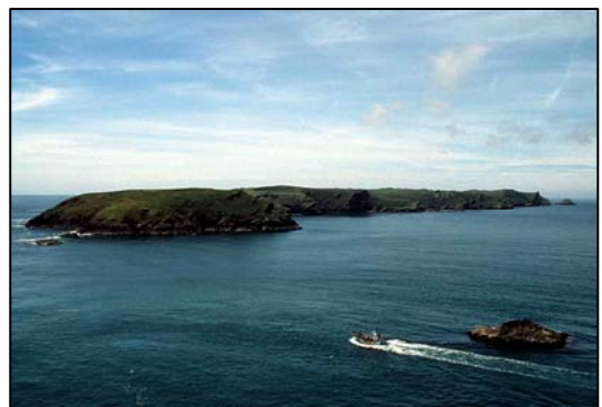
Skomer Island (Pembrokeshire)