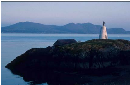
Ynys Llanddwyn (Anglesey) & Caernarfon Bay