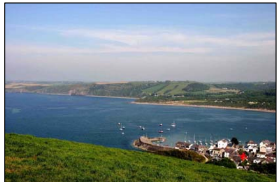
New Quay (Ceredigion)