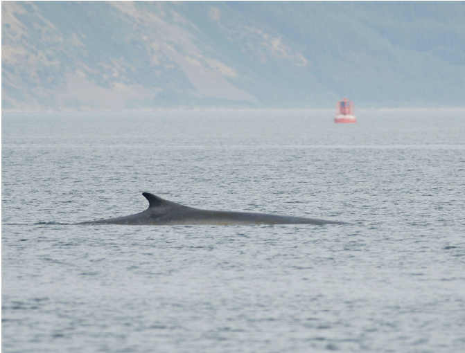
Fin whale, Rosemarkie Bay

The resident bottlenose dolphins have been seen almost daily at both Chanorny Point, Fort George and further into the Firth. A pod of nine common dolphins was also seen almost daily between North Kessock and Clacknaharry and further into the Beaully Firth, and apparently they have been seen breaching and occasionally mixing with bottlenose dolphins. Unfortunately I have only seen them at long range. Minke whales have been seen regularly around Cromarty. I have seen them lunge feeding from the South "Sutor" and the Ecoventures boat has observed up to 12 on one trip as well as the usual bottlenose dolphins. There has been a spate of sightings of harbour porpoise around Chanorny Point this month, and the highlight of the period must be the fin whale that was photographed in Rosemarkie Bay on 25 th July- WOW!