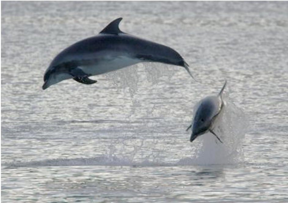
Bottlenose dolphins, Loch Spelve, July.