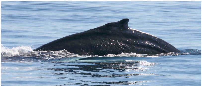
Humpback whale, Pia Anderwald

Charters out of Neyland. One of the animals, which was thought to be a juvenile, was swimming slowly and approached the boat at times, often surfacing astern of the vessel. The other whale kept its distance and was never photographed. A group of common dolphins, which were bow-riding "Liberty" at the time of the encounter, left the vessel to play with the smaller one of the whales, swimming fast and jumping around it. The whale seemed to respond positively to the dolphins playing with it, and was seen rolling onto its back in the middle of the group, showing part of its flukes and white flippers. Humpback whales are scarce in the Irish Sea although there are usually one or two sightings per year. The last sighting was of three individuals in Cardigan Bay in July 2005.