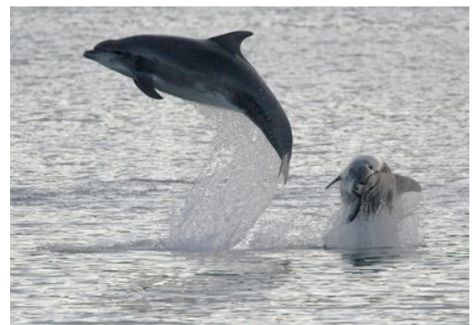
Bottlenose dolphins

Bottlenose dolphin numbers were very healthy, as can be seen from the fantastic photographs taken from Loch Spelve, and we've even had them make another appearance in Tobermory bay! This made for a great start to our Bottlenose dolphin project with people calling our hotline from all over the west coast from Muasdale Holiday Park in the South, where Bottlenose dolphins are regular visitors, to tourists off the Isle of Skye reporting a group playing around their yacht.