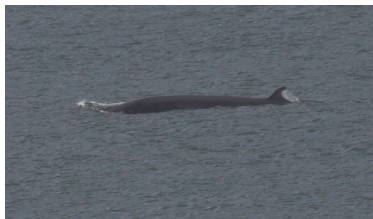
Photos taken on 9 th November, 300m off shore in Laxey Bay, Isle of Man.