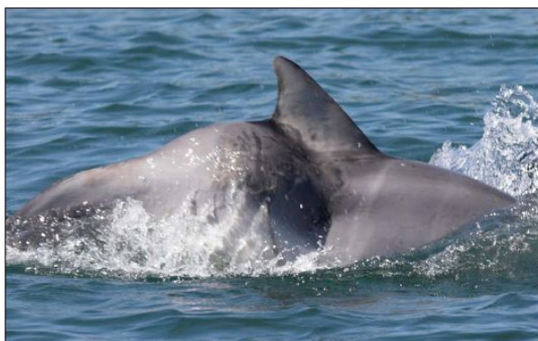
Juvenile bottlenose dolphin exhibiting skeletal distortion, Newtonhill.

With the exception of the first week, November was a very windy and stormy month. Combined with the usual short days, this resulted in a dramatic drop in sightings, but as usual, the almost guaranteed occurrence of bottlenose dolphins around Aberdeen harbour did mean that when a land based survey was run, observers were rewarded with a fine display of leaping/splashing and feeding. The October pattern continued, with two successful boat trips possible at the start of the month in warm conditions (last year, by this time we'd had our first dusting of snow!) and fairly calm seas. The surveys were run after a windy spell in October and thus encountered some fantastic birds, including several little auks. Other birds of note were skeins of barnacle geese, a Slavonian grebe, bramblings coming in off the sea, some very late puffins, black guillemot, and red throated divers. On the cetacean front, both trips (3 rd and 4 th November) encountered bottlenose dolphins and harbour porpoise on a couple of occasions. One of the encounters was with the