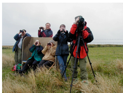
Land-based sea watchers at last year's event