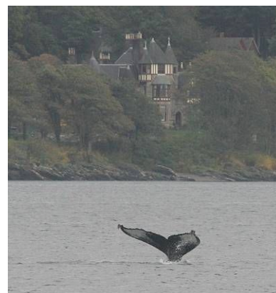
Photo of the humpback whale in Loch Long.

Other sightings from the region include a minke whale seen between Arisaig and Eigg in late October, two common dolphins at Largs marina in mid November and another humpback whale in the Sound of Rona, Isle of Skye at the end of November. During October and November, harbour porpoises were seen regularly in Dumfries and Galloway and Ayrshire, particularly off Arran, Mull of Galloway and Balcary Point (Mull).