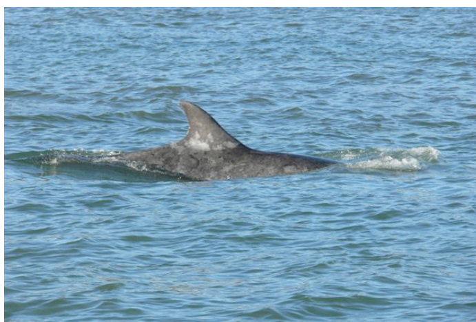
Heavily lesioned bottlenose dolphin seen on 3rd November's boat survey

The remainder of the sightings were largely from Stonehaven with 10 and then Arbroath and Muchalls each having two and Montrose one sighting. Groups of 15-28 were seen around Aberdeen harbour on a daily basis at the beginning of the month (although rough seas in the third week of October precluded much watching). For the remainder of the month, group sizes of 6-15 were more typical. Unusually, there were also singles off the coastline on the 6 th , 10 th and 14 th October. The group of 28 bottlenose dolphins were seen feeding at Aberdeen harbour entrance for almost nine hours on the 8 th October. This group comprised several calves, including one with a large lump behind the dorsal fin, which was also encountered during a boat survey in April. Another notable dolphin on this particular date was "Runny Paint", a well marked individual that is in our photo-ID catalogue. Other notable sightings were 15 on the 6 th October (Girdleness), 15 at Torry Battery on the 15 th October, and 10 at Stonehaven on the 20 th October.