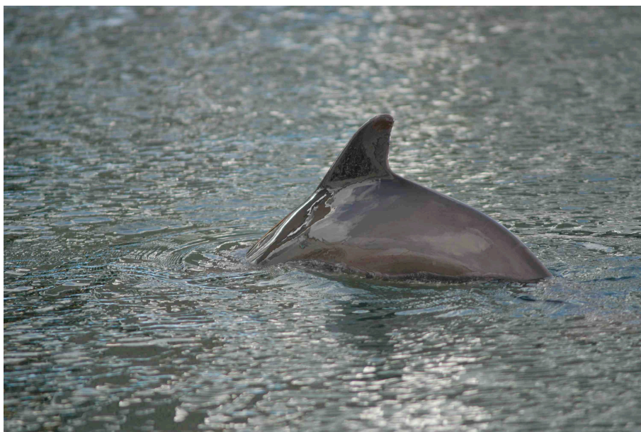
Harbour porpoise, (Photo: Mick Baines)