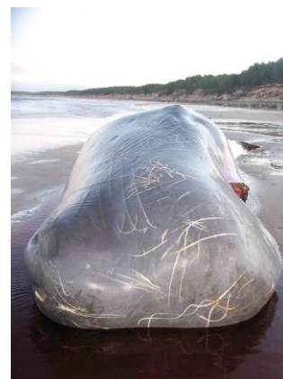
Stranded sperm whale with jaw missing on the beach at Burghead by Peter MacDonald.

A solitary minke whale was spotted off Burghead a few times in October. A northern bottlenose whale was found dead on the Black Isle in mid October. The highlight of the season, however, was a group of nine sperm whales spotted from the RAF search and rescue helicopter just three miles off the mouth of River Spey in mid November. Sadly one sperm whale was reported stranded in early December in Burghead, and may have been from this group. A dead northern bottlenose whale was found near Black Isle in mid October. Towards the end of the month, the sightings were mainly of harbour porpoise, seen from Lybster.