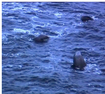
Sperm whales recorded by RAF Lossiemouth D-FLT 202 Squadron.

In October, the sightings rate dropped, but sightings of mainly harbour porpoise were still received from Lybster, Whaligoe, Strath Steven and Burghead. During October and November, bottlenose dolphins were seen a few times in the Inner Moray Firth and North Grampian coasts and once off Nigg further north. One record of either white-beaked or white-sided dolphins was reported during this period.