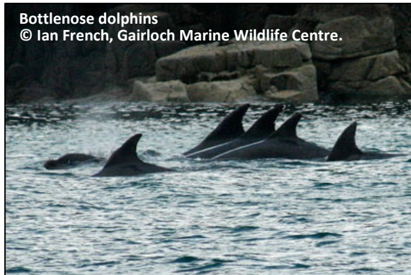
Bottlenose dolphins

A group of approximately 15 bottlenose dolphins visited Loch Gairloch on a number of occasions during July.