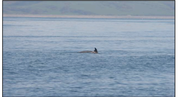
Force 1: ripples