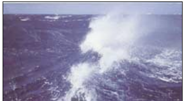
Force 11: extremely high waves, visibility affected