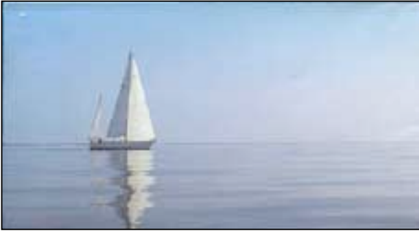
Force 0: sea like a mirror