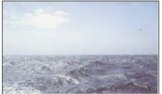
Force 5: moderate waves, many white horses