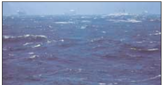
Force 7: sea heaps up, waves break