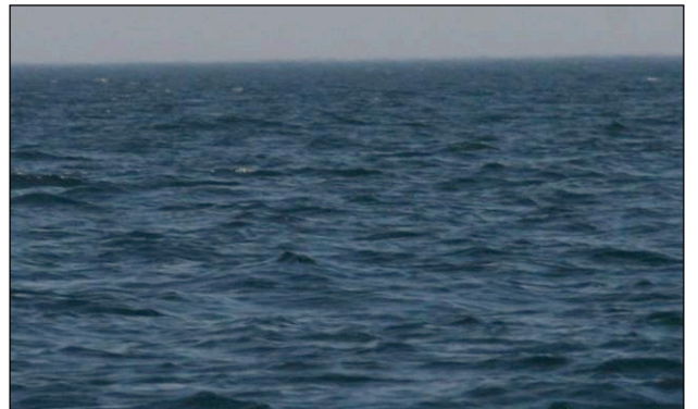
Force 3: large wavelets, a few whitehorses