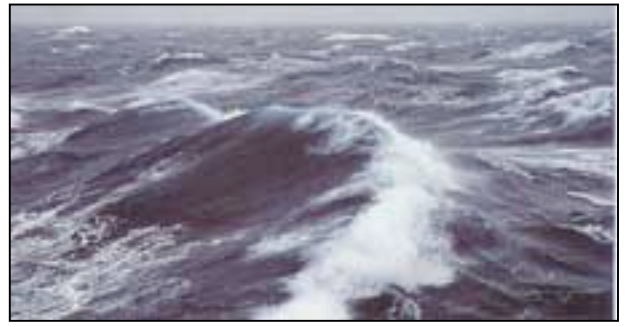
Force 9: high waves breaking, spray