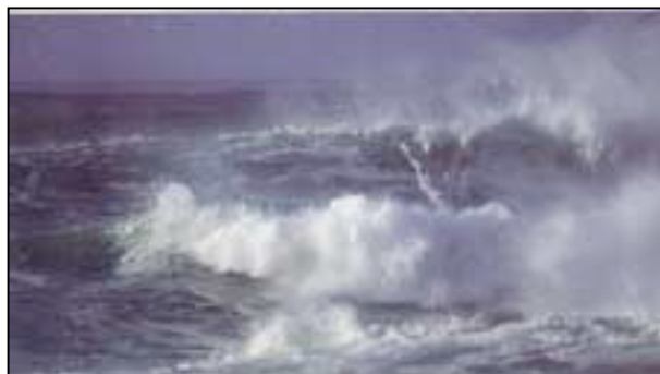
Force 12: air filled with spray, sea completely white, visibility very seriously affected