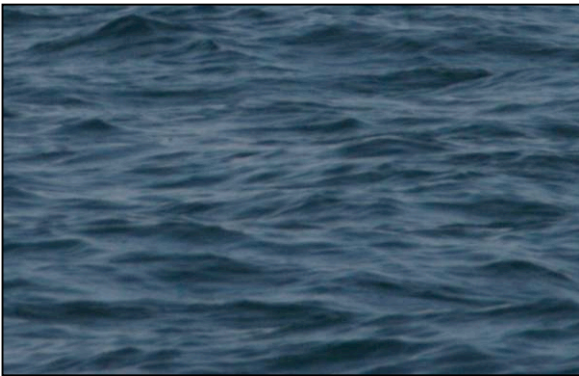
Force 2: small wavelets