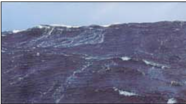
Force 10: very high waves