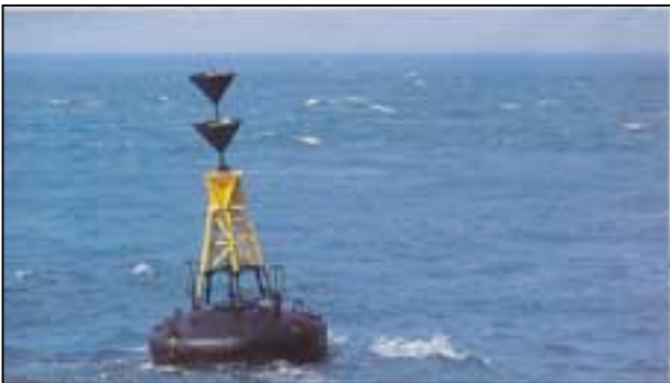
Force 4: small waves, frequent white horses